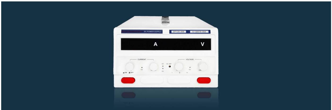
Fig.1: DP-S Series Power Supply (DP120-30S)